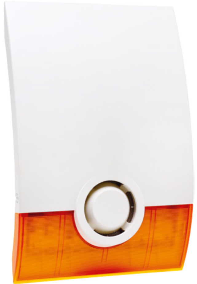
Orange Flash OSX 200 & OSX 601