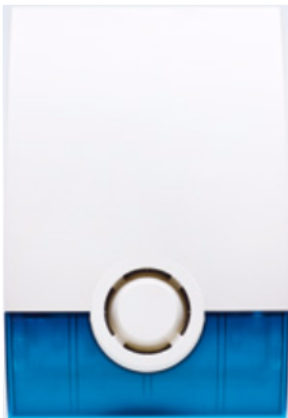
Blue Flash OSX 210 & OSX 712

Visual and audible annunciation of alarms in Videofied security systems